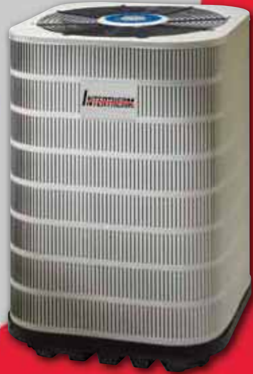
Models ES4BD & ES4QD

PERMANENTLY LUBRICATED MOTOR DELIVERS LONG-LASTING RELIABILITY AND QUIET OPERATION.