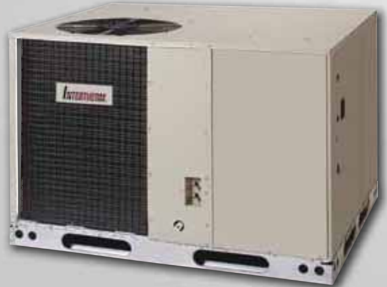
Models P8SE (14 SEER, up to 11.5 EER) & Q6SE (14 SEER, 11 EER, 8.0 HSPF)