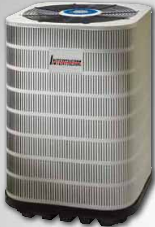
Models ES4BE, ES4QE, ET4BE & ET4QE