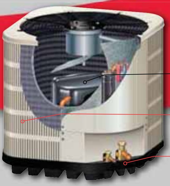
Model ES4BD 13 SEER Air Conditioner