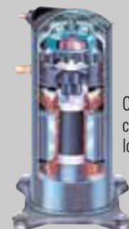
Model Q6SE 14 SEER, 11 EER, 8.0 HSPF Heat Pump

Copeland® scroll compressors provide long-lasting reliability.